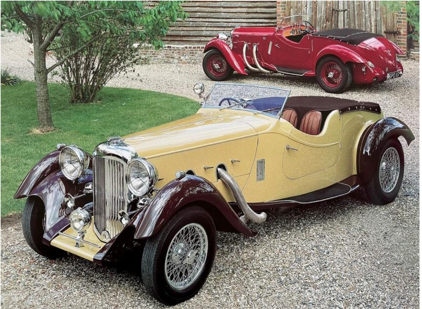
Lagonda LG 45 Rapide „GPD 117“ (back) together with the LG 45 Rapide of actor Clark Gable from 1937

Source: „LAGONDA – DIE 4.5 LITER WAGEN DES W.O. BENTLEY“ by Bernd Holthusen, 1994, page 300